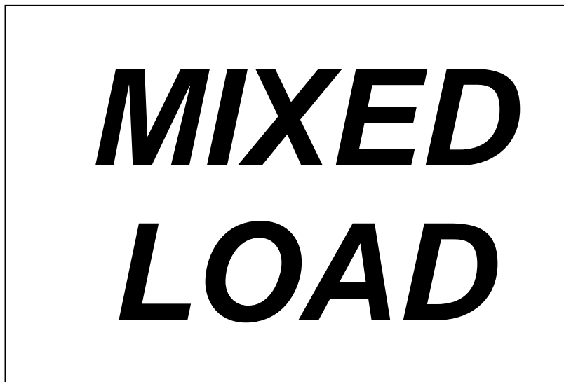
FIGURE # 3

There are no fields for this label – text only.